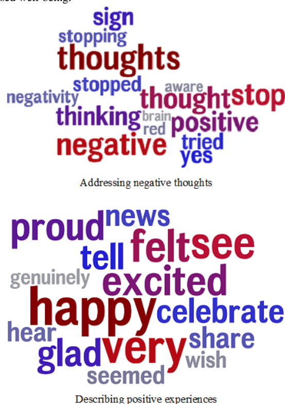
Figure 2. Example topics predicting increased well-being.

We reran the topic analysis only for users with initially high well-being to address the possibility that the results were influenced by a ceiling effect. The results are similar to those of the overall sample (see Multimedia Appendix 5).